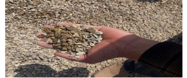
Figure.2 Coarse Aggregates