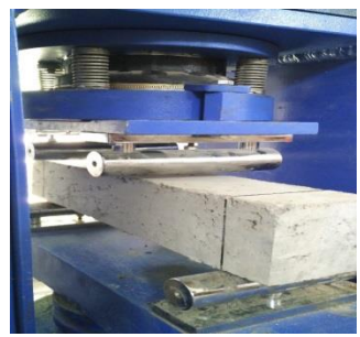
Figure.5 Flexure Strength Test

b= width of specimen, d= depth of specimen, and a = distance between crack and the nearest support