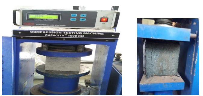
Figure.3 Setup for Compressive strength

Where, P = load in KN and A = Area of cross section